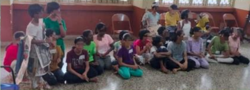
AFJM Outreach at St. Anthony's Orphanage