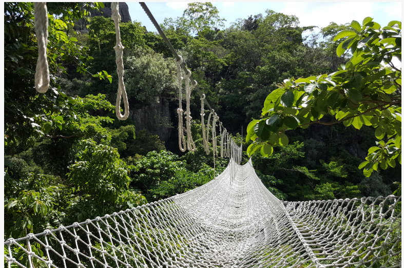
WE WEAVE PATHS OF ENCOUNTER...

My house. Community, which seeks the following of Jesus.