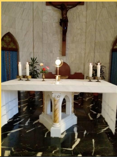
Chapel of the JM Institute Via Flaminia, Rome

The theme was the PREFERENCES, the document of the 37th General Chapter, given for all the Family of “Jesus and Mary”.