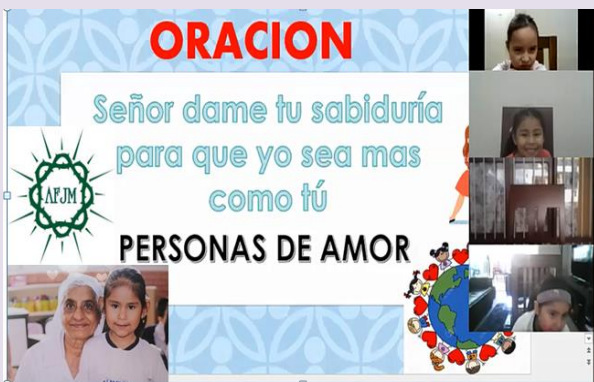
Photo of prayer with children from 3 to 5 years